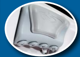
3 NeckFlex Pillows